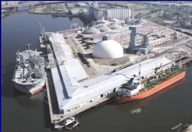
Port of Stockton