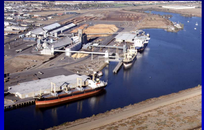
Port of Sacramento